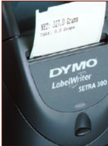
Dymo™ Labelwriter SE300 Thermal Printer

The Himalaya Series of single range balances combines versatility with very high readability. The six button keyboard affords great flexibility by allowing a choice of several weighing modes. In addition to measurements in units of grams, ounces and carats, each HI balance can display weight as a percentage for use in checkweighing and as grams per second to monitor flow rates. A user defined unit can be programmed for any unit of measure, such as ml for measuring volume and $ for measuring value. The MODE key may be used to select either a fast or slow display update rate. This key can also be used to lock in a displayed weight, a feature which is useful in continuous weighing applications. The PRINT key may be set to transmit data immediately, continuously, or at selected time intervals.